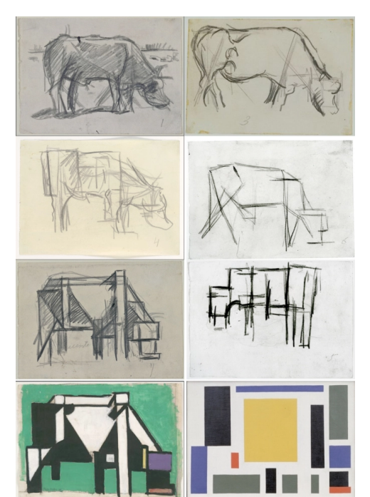
Theo Van Doesburg The Cow. 1916. Gouache, oil, and charcoal on paper. Moma. New York, NY.